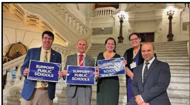
I was honored to receive the Champion of Public Education Award from the PA School Boards Association.