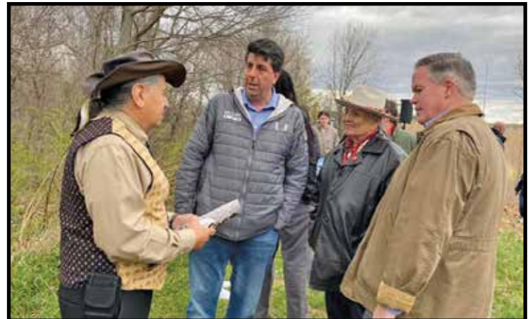
I attended the dedication of the Lenape Arboretum, welcoming the Lenape people back to the community to honor their history, culture and legacy in the Perkiomen Valley.