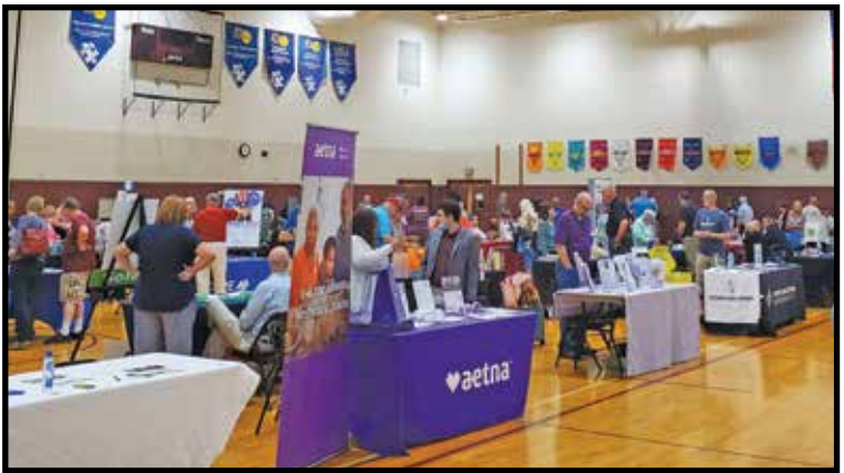
We had more than 200 seniors attend our Senior Fair.

You don't need to do anything to receive this rebate and you will receive it by the same method (direct deposit or check) that you received your original rebate.