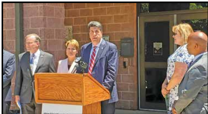
I joined our region’s education leaders to again call for change to help our public schools.

These are some highlights of a budget, helped by a robust state budget surplus and one-time federal American Rescue Plan Act (ARPA) dollars, that invests in our state’s future.